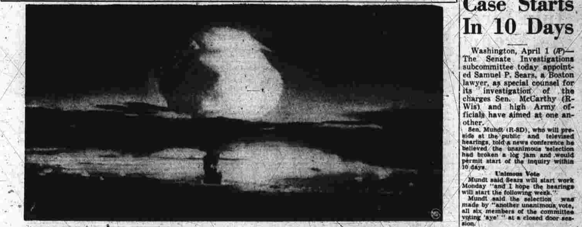
This photo, released by the Federal Civil Defense Administration, shows the H-bomb explosion in the Marshall Islands in the fall of 1952. Taken at a height of about 15,000 feet and 50 miles from the detonation site, the photo shows the mushroom and cloud rising above the ocean. The mushroom went up 10 miles and spread for 100 miles. The cloud beneath the mushroom rose to 40,000 feet.