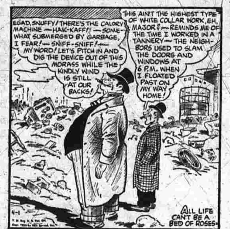
Happy Days BY V. T. HAMILIN