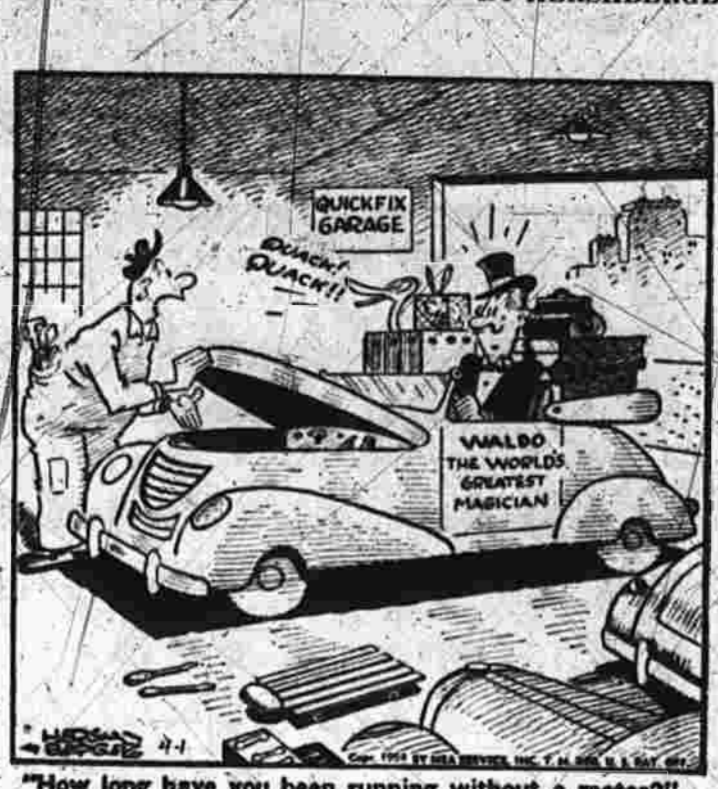
"How long have you been running without a motor?"